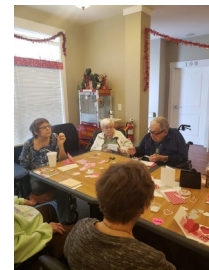
Handmade Valentine cards