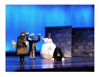
Music concerts and the play "Beauty & The Beast" at CPAC