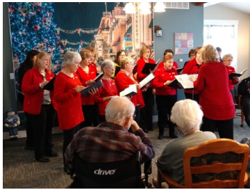
GF of Women's Club