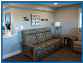
Front entrance at The Haven

On September 20, we hosted a "by invitation only" Grand Opening for "The Haven", the newest addition to the Hope Landing ALC family and on October 5 th we welcomed our very first resident. What an exciting time! Please feel free to stop by and tour the facility when you are in the neighborhood.