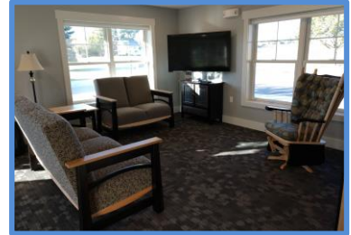
Activity Room at The Haven