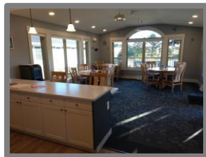
The Haven dining area