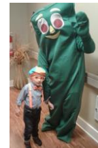
A fun time for all at Halloween!