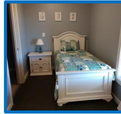
Model of a resident room