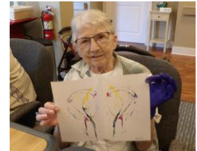
Beautiful string paintings

The kids really enjoyed the toothbrush painting.