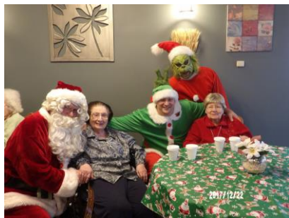
What a Prankster!