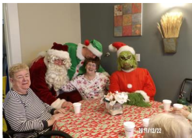
Some girls have all the fun!!