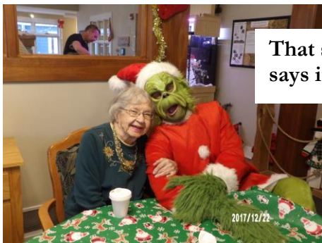
That smile says it all!