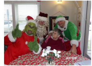
Thanks to Santa, Buddy the Elf and the Grinch for stopping by and making our day bright!!