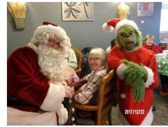
Awww, ain't they sweet!!!